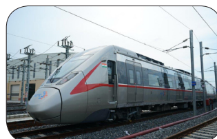
India's first Semi High-Speed Regional Train by Alstom – RAPIDX gets inaugurated, sets a new world standard in advanced signaling technology